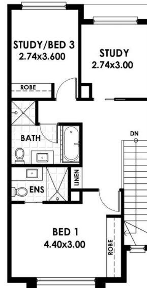
FIRST FLOOR PLAN SCALE 1:100 @ A3